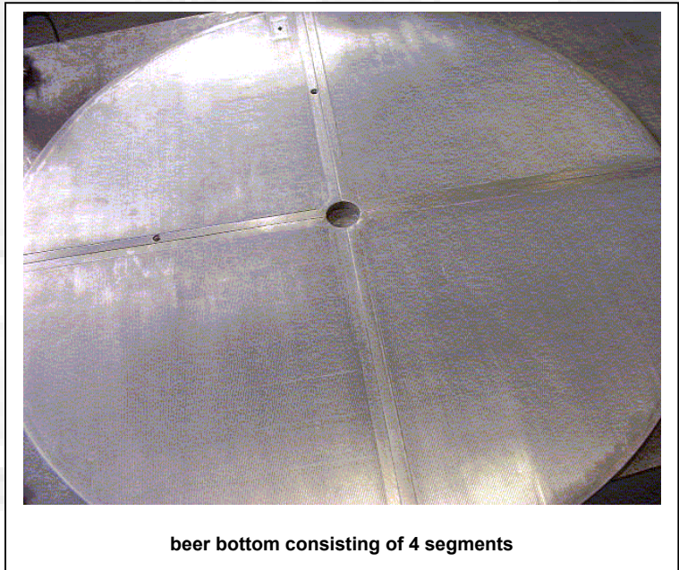
beer bottom consisting of 4 segments

References can be submitted on request and after discussion with our customers.